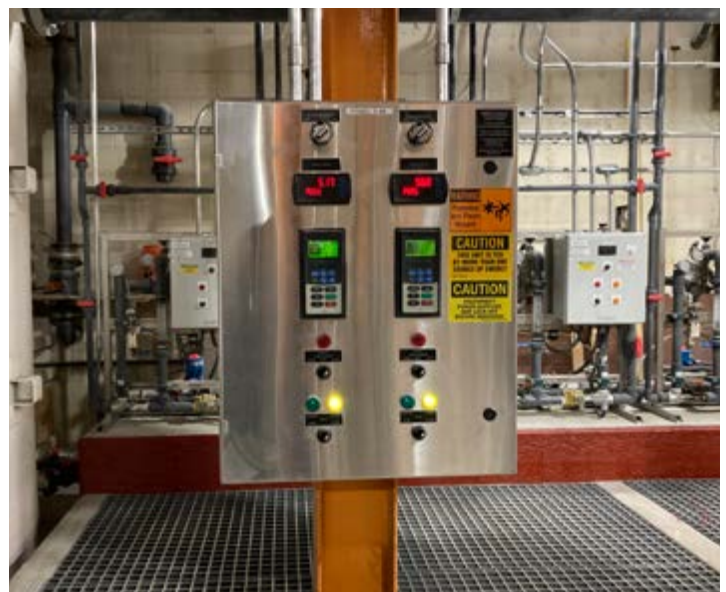
Wichita WWTP#2 – Polymer Feed Pumps