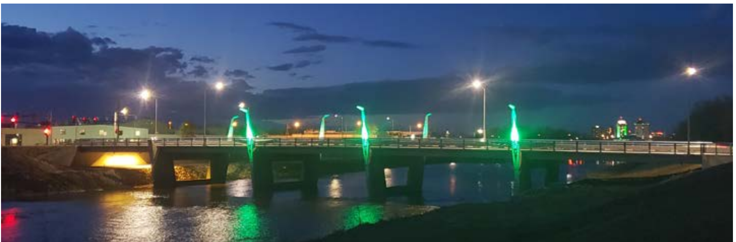
City of Wichita – Harry Street Bridge