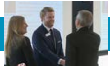
OUTSTANDING ENGINEERING ACHIEVEMENT KTA Open Road Tolling Conversion - East Topeka Terminal (Kansas Turnpike Authority & HNTB Corporation)