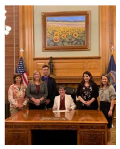
Photos have been collected from the internet. No copyright infringement is intended.

Wichita Society of Professional Engineers Kansas Society of Professional Engineers