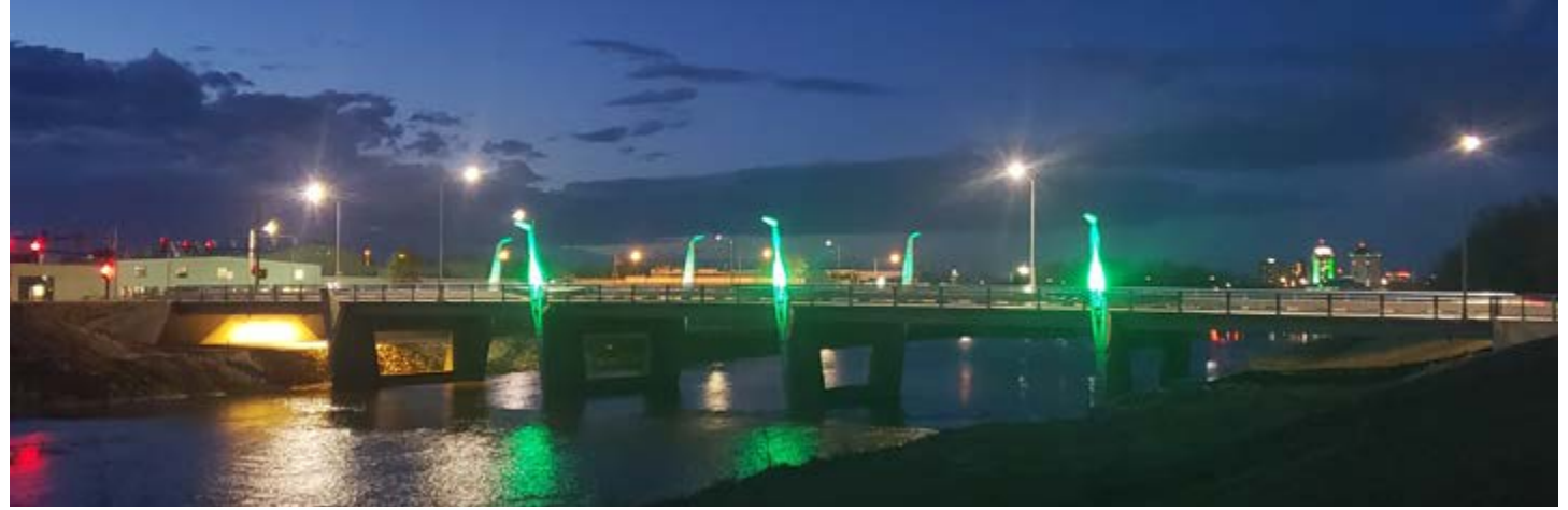
City of Wichita - Harry Street Bridge