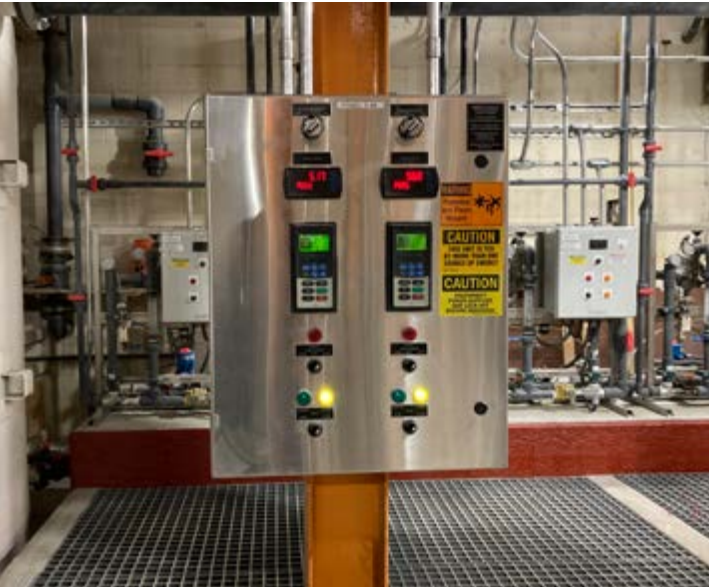
Wichita WWTP#2 - Polymer Feed Pumps