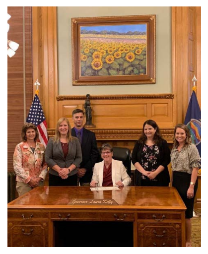
Photos have been collected from the internet. No copyright infringement is intended.

Wichita Society of Professional Engineers Kansas Society of Professional Engineers