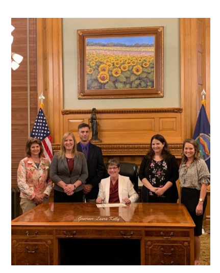
Photos have been collected from the internet. No copyright infringement is intended.

Wichita Society of Professional Engineers Kansas Society of Professional Engineers