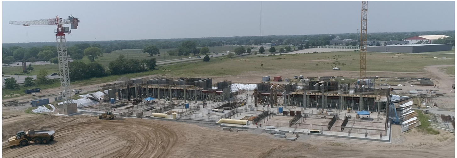
Wichita Northwest Water Treatment Facility