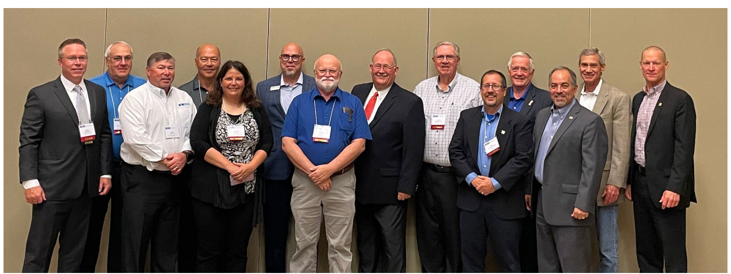
KSPE 2021 Annual Conference - Manhattan, KS