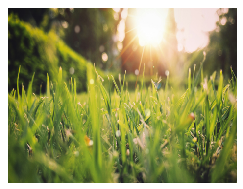
On the cover: Kansas in Spring.