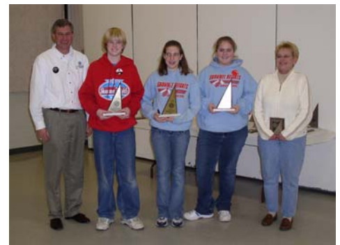
Shawnee Heights Middle School, Tecumseh, finished first in team competition

Statewide, 73 schools comprising a total of 474 students registered for the 2003-04 MATHCOUNTS competition. Of these, 88 students from 25 Kansas schools participated at the state level in the 21 st annual contest.