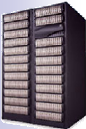
LSI Logic Storage Systems' E4600 Disk Storage System

The E4600 is sold to both OEM companies, who in turn resell to end customers under their brand name and model designation, and sold by LSI Storage Systems to resellers and to end-customers. The fourth generation product was initially marketed in early 2001 to various OEM customers and shipped to LSI beta sites in May of 2001. Sales for the product total around $100 million since introduction.